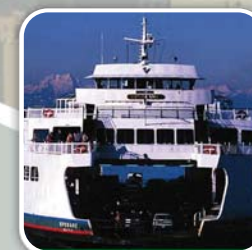
WASHINGTON STATE FERRY TERMINAL