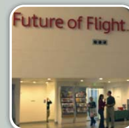
BOEING TOUR CENTER