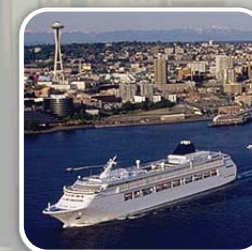
SEATTLE CRUISE SHIP TERMINALS