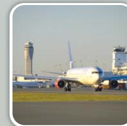
SEATTLE INTERNATIONAL AIRPORT Gateway to the Northwest