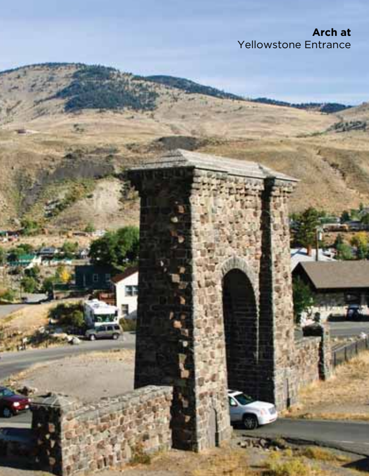
Arch at Yellowstone Entrance

VISITOR SERVICES WATER SPORTS ATTRACTIONS SIGHTSEEING LODGING DINING HELPFUL NUMBERS