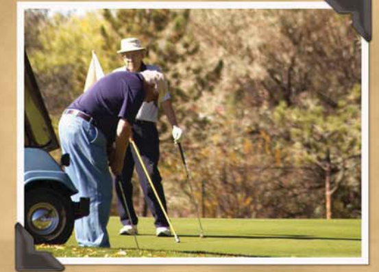
Day 2: Shot the back 9 at Cattails Golf Course.