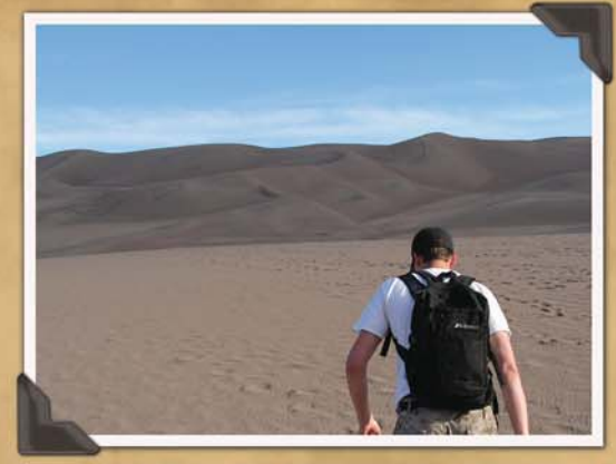
Day 1: Hiked the Sand Dunes and took in the scenes. The views from the top were breathtaking!