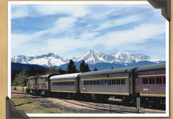
Day 3: Took a mountain excursion on the Rio Grande Scenic Railroad to La Veta. Life is good!