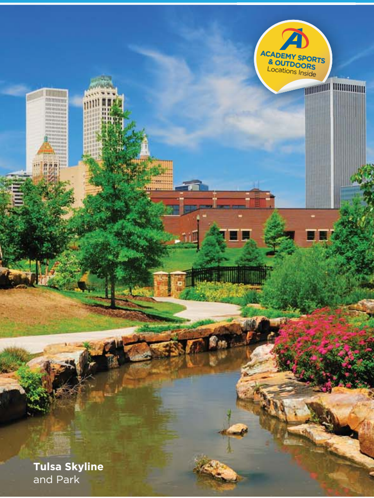
Tulsa Skyline and Park