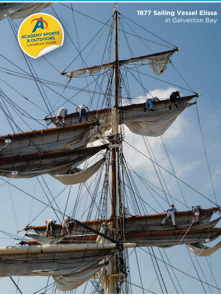
1877 Sailing Vessel Elissa in Galveston Bay

VISITOR SERVICES SPORTS ATTRACTIONS SIGHTSEEING DINING HELPFUL NUMBERS