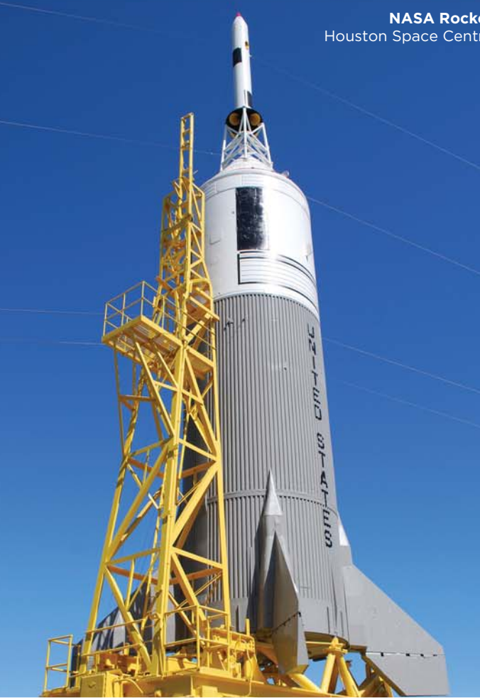
NASA Rocket Houston Space Centre

VISITOR SERVICES SPORTS ATTRACTIONS SIGHTSEEING DINING HELPFUL NUMBERS